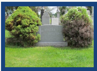
No trees, shrubs or rose bushes.