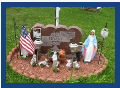
No borders, stones, fencing, glassware, or concrete products.